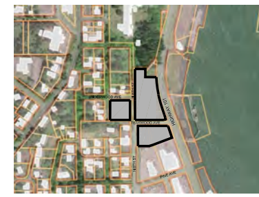
VICINITY PLAN SCALE: N.T.S.